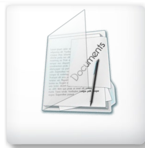
Elite Escrow/ Closing Support