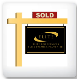
Elite Personalized Marketing Support