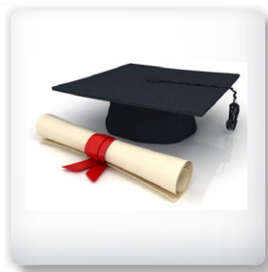
Elite's Real Estate Training Courses & Certifications