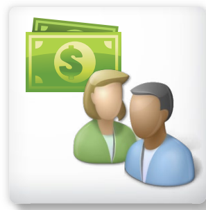
REO Accounting Financial Support & Coaching

THE ELITE GROUP IS NOT A NEWCOMER TO THE INDUSTRY. ITS MANAGEMENT TEAM HAS EARNED AN EXCELLENT REPUTATION THROUGH YEARS OF EXPERIENCE AND ACHIEVEMENT.