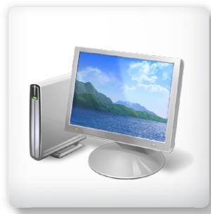
Elite Software Support Online Management System